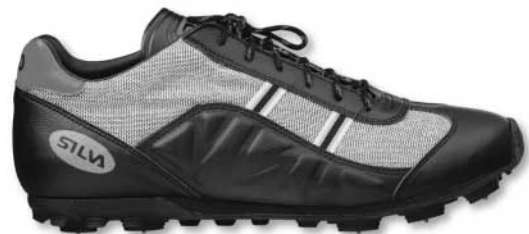
K80 The new challenger