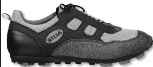
K100 Developed for World Champions